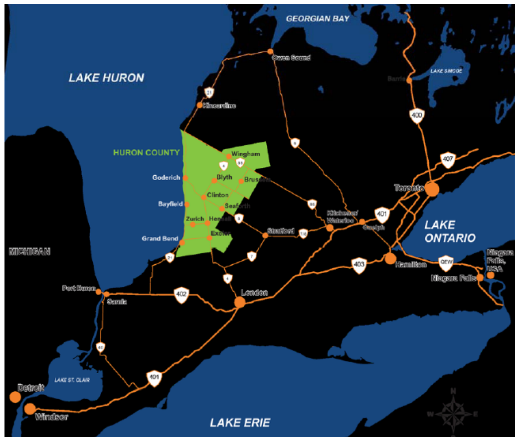
Huron County (The State of the Huron County Economy 2010)